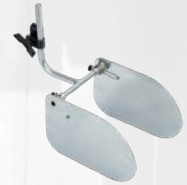
WindGuard Spray Shield