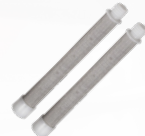
White 60 Mesh Filters (2-pack)